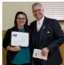
April 28 - Community Foundation Scholarship awards (Homer)