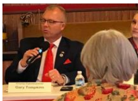
April 25- Streets & Sidewalks mtg (Albion)