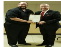
April 4- Elks Distinguished Citizen Award (Albion)