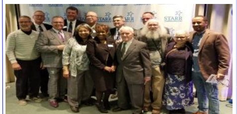
April 11- Starr 3rd Annual Night of the Stars (Albion)