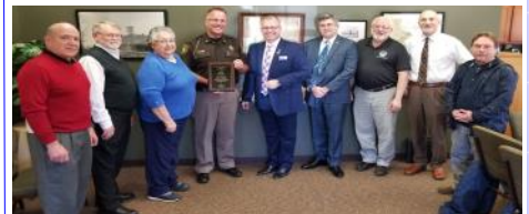
April 9- Albion/Homer Substance Abuse mtg. (Homer)