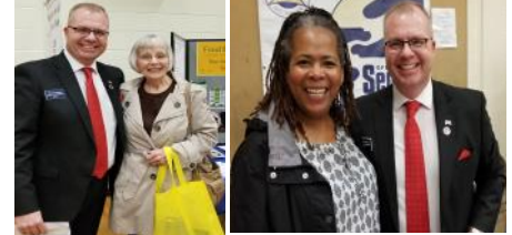
April 4 - Calhoun County Senior Fair (Marshall)