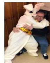
April 20 - VFW Bunny Brunch (Homer)