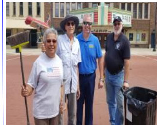
Aug. 22– Clean up the City (Albion)