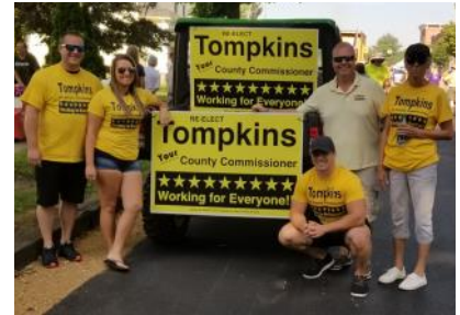
Aug. 3- Homer is Home Festival (Homer)