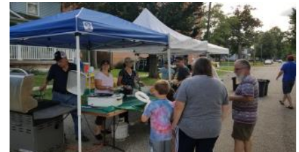
Aug. 6 – National Night Out (Albion & Homer)