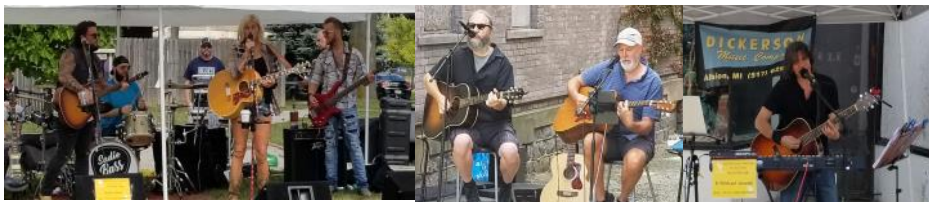
Aug 24– Walk the Beat (Albion)