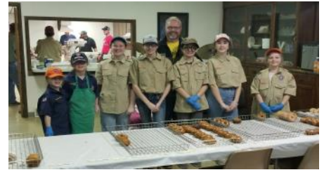
Feb. 1 - BSA Troop 158 Doughnut Fundraiser (Homer)