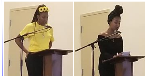
Feb. 8- 1st Ann. Black History Program (Albion)