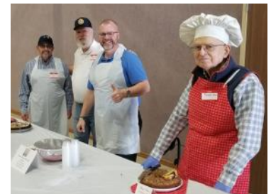
Feb. 16– Men Who Cook (Albion)