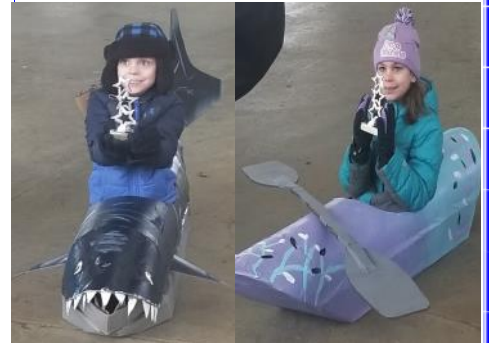
Feb. 1 Winterfest Cardboard Classic Sled Judging (Albion)