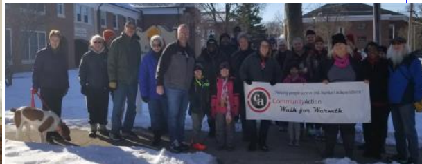
Feb. 29– Walk for Warmth (Albion)