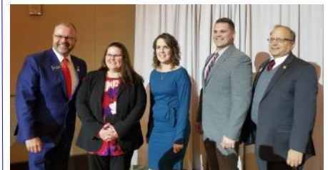
Jan. 25- VFW Teacher Awards (Kalamazoo)