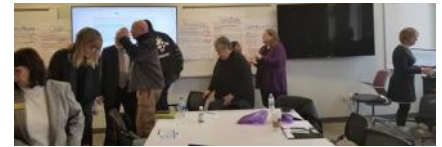
Jan 8. - Suicide Prevention Coalition Mtg. (Albion)