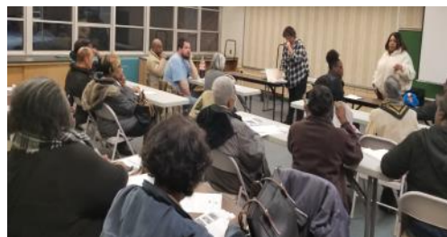
Jan. 30- Albion City Precinct 1 mtg (Albion)