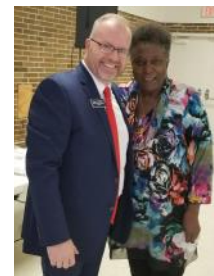
Jan. 20- 3rd Ann. MLK Dinner (Albion)