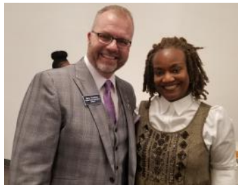
Jan. 28 - MLK Convocation (Albion)