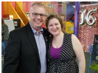
March 23 – Kids N Stuff Sweet 16 B-Day Bash (Albion)