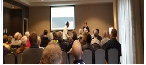
March 7 – Albion Economic Forecast (Albion)