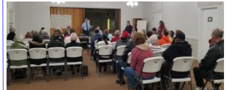
March 14 – Irwin Ave Road Project Forum (Albion)