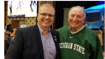
March 9– Oaklawn Benefit Auction (Firekeepers Casino)