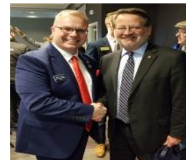
March 15– Roundtable w/ U.S. Sen. Gary Peters (Albion)